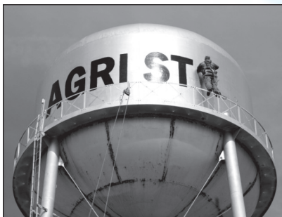
Agri Star replaces Agriprocessors on Postville water tower