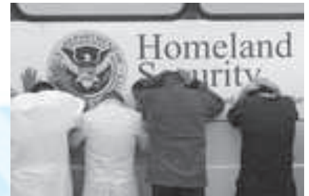
Undocumented immigrants are lined up against a Homeland Security bus in El Paso, Texas, so they can be unshackled and led across the Mexican border to Juarez.

Jewish Community Action is echoing the call from local and national immigrant-led and immigrant rights groups to end raids. We are speaking up as Jews, alongside immigrant communities. We know that we can only make change together.