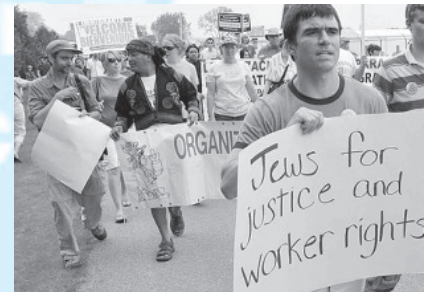
March in Postville, IA

PROGRESS BY PESACH is the national Jewish campaign to encourage the new administration and congress to choose humanitarian immigration reform over the failed policy of exclusively relying on raids and enforcement tactics as a means of controlling immigration.