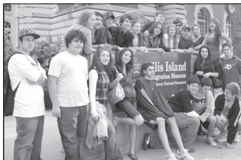
Previous Confirmation Class visits Ellis Island.

Come enjoy a bagel and men's club flipped pancakes, schmooze with friends old and new, meet the teachers, as we kick off the beginning of our 2009-2010 school year!! Watch for more details!